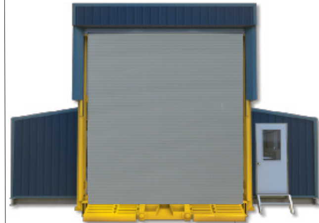
Extended Side Pods