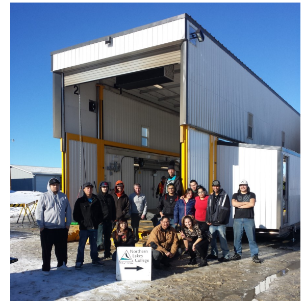
Students celebrate the arrival of the NLC Trades Training Lab at the Sturgeon Lake Indian Band

Bringing state of the art training facilities to remote locations