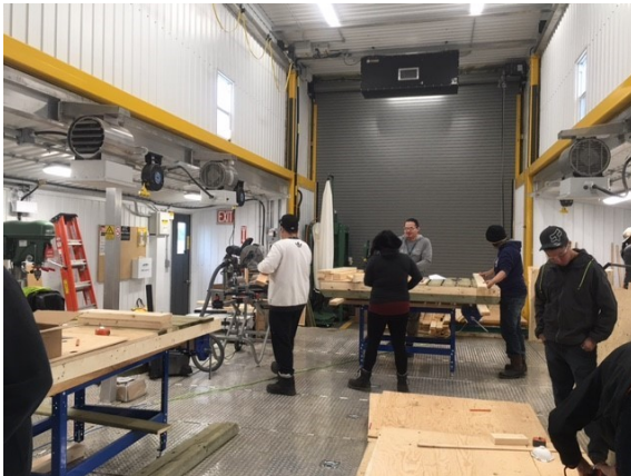
Fully Equipped Carpentry Lab