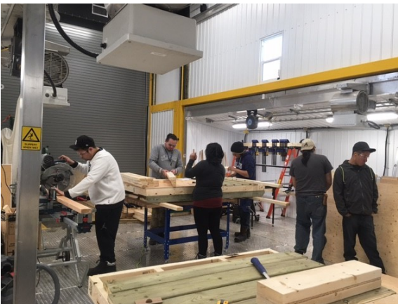
Students at Work