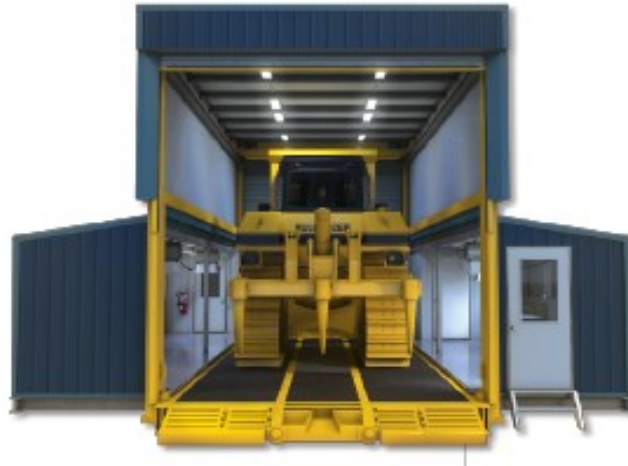
Extended Side Pods