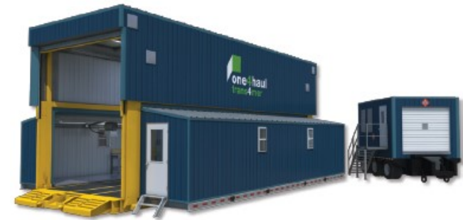
Installed with Pup Trailer Mounted Genset

The center roof section telescopes to a height of 20 feet, the side pods which are nested within the center unit during transport, expand to create a 6 foot wide by 8 foot high by 38 foot long work area on each side of the center unit. They are supported by integral mechanical jacks. The roof and side pods are positioned with integral hydraulics. Set up / take down time is approximately one to two hours.