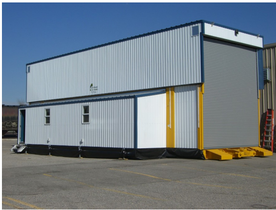
Set Up in Less Than One Day